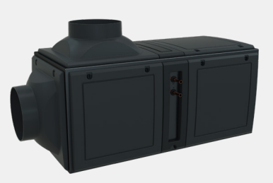
Water-cooled systems available. *Patent Pending

Wine Guardian Pro units come installed with service ports, appropriate pressure switches, and a refrigerant sight glass to allow for faster and more efficient maintenance.